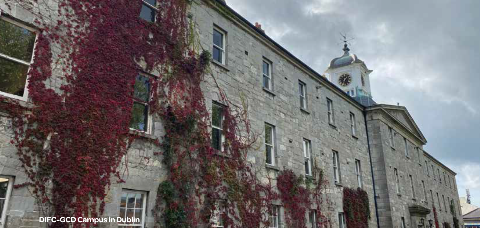
DIFC-GCD Campus in Dublin